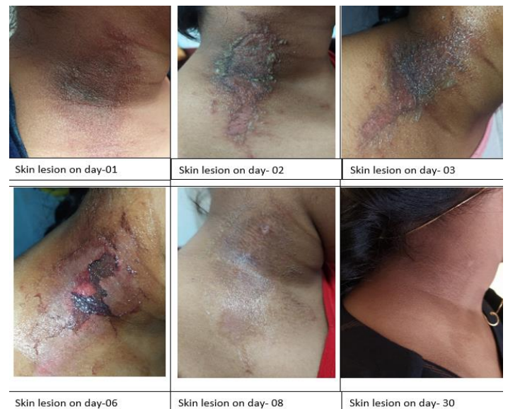
Figure 1: Skin lesion recovery

Triphala guggulu acts as Shothahara and Shulahara, Triphala has antiviral property. Amruta Guggulu is directly indicated in Kushta and it acts as Shothahara and Vranahara, Guduchi present in it reduces burning sensation and it also has antiviral property. Avipattikara churna is majorly indicated in Pittaja vikara, and it acts as Nitya Virechaka. Manjistadi Kashaya does Rakta shodhana (blood purification), Amapachana and it is Vishahara in nature. Chandanasava pacifies Pitta dosha and acts as Raktaprasadaka and Agnideepaka. Khadirarista is indicated in all varieties of skin diseases as it is Rakta Shodhaka. Gandhaka Rasayana has Kushtahara property. Shatadhouta ghrita acts as Vruna ropaka (wound healing), Kumkumadi lepa reduces the hyperpigmentation of the skin lesions.